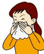
blow your nose

Next week, your close friend plans to move to other city. What do you want to say to your friend? Write a letter to the friend☺