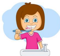
brush your teeth